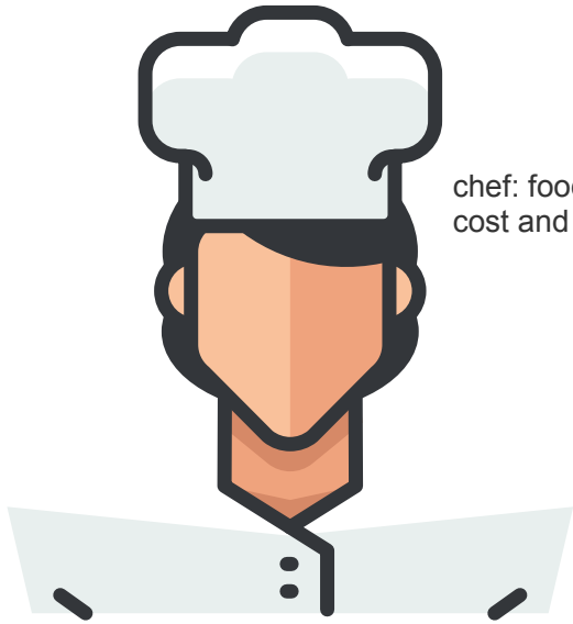
chef: food and labor cost and sales