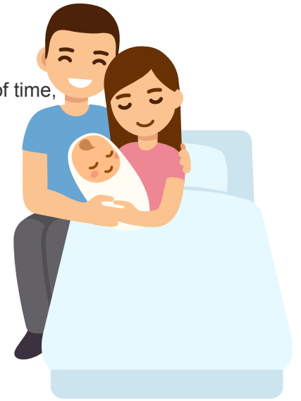
busy parents, lack of time, money, skill