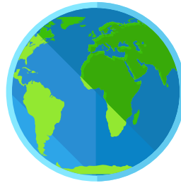
Environment or animal lovers - morally concerned people