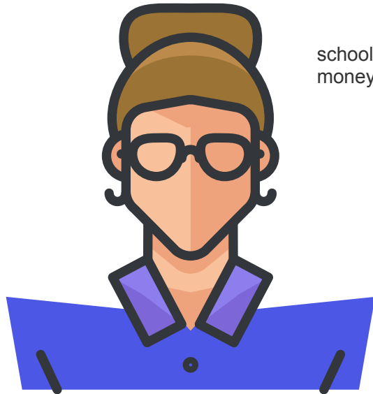
school food service: time, money, kid's acceptance